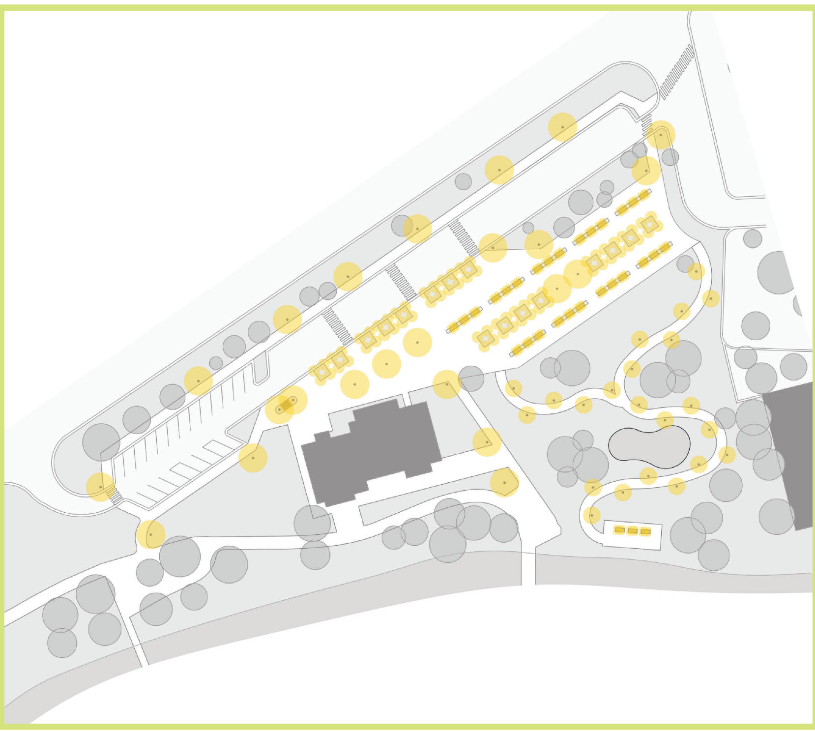
Lighting- A range of dynamic lighting fills the space with ambiet light while minimizing light pollution.