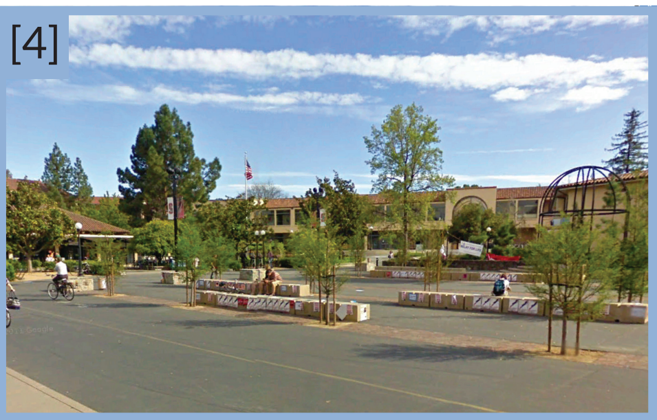
Bench Seating- This type of seating defines cite circulation while providing the perfect layout for hosting farmers market events.