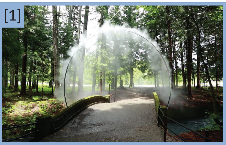
Mist Arch- This installation will provide relief from summer heat, and provide visual appeal and intrigue.