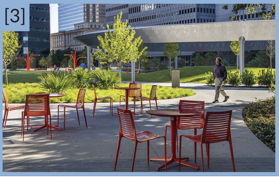
Flexible Seating- This seating provides maximum flexibility, and support to farmers market activities while permitting open space