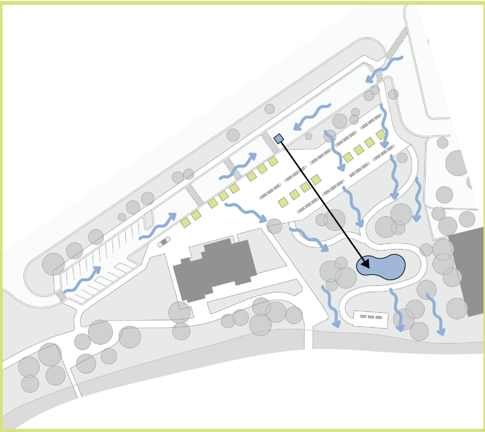
Stormwater Management- Stormwater management tools include a large stormwater retention and filtration pond, rain gardens, Increased vegetation along riverbank for filtration and stabilization as well as native grasses throughout the site that serve naturally to filter runoff.