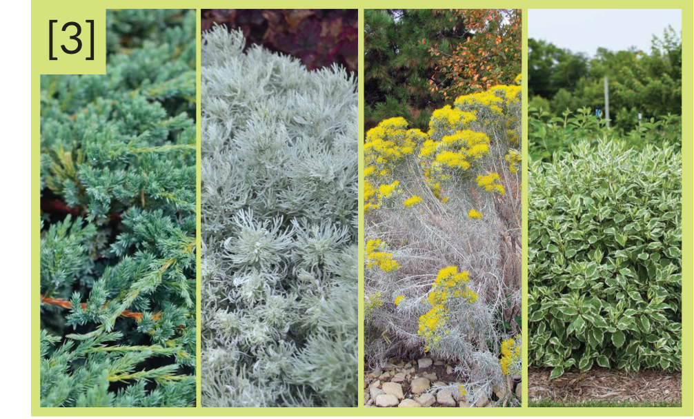
Shrubs- Various Juniper, Silver Sage, Blue Dwarf Rabbit Bush, Various Dogwoods