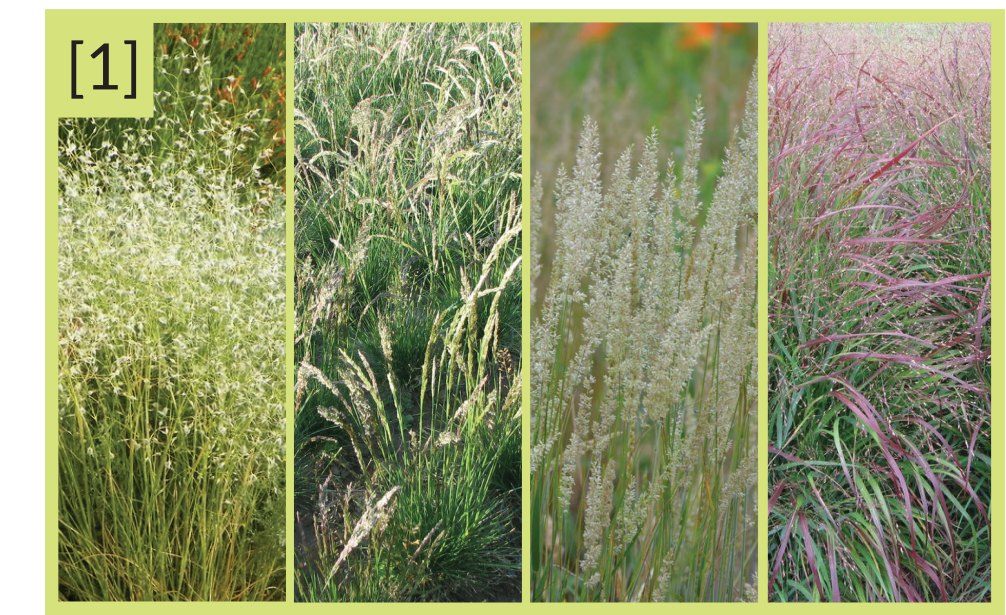
Grasses- Indian Rice Grass, Sandburg Bluegrass, June Grass, Switch Grass