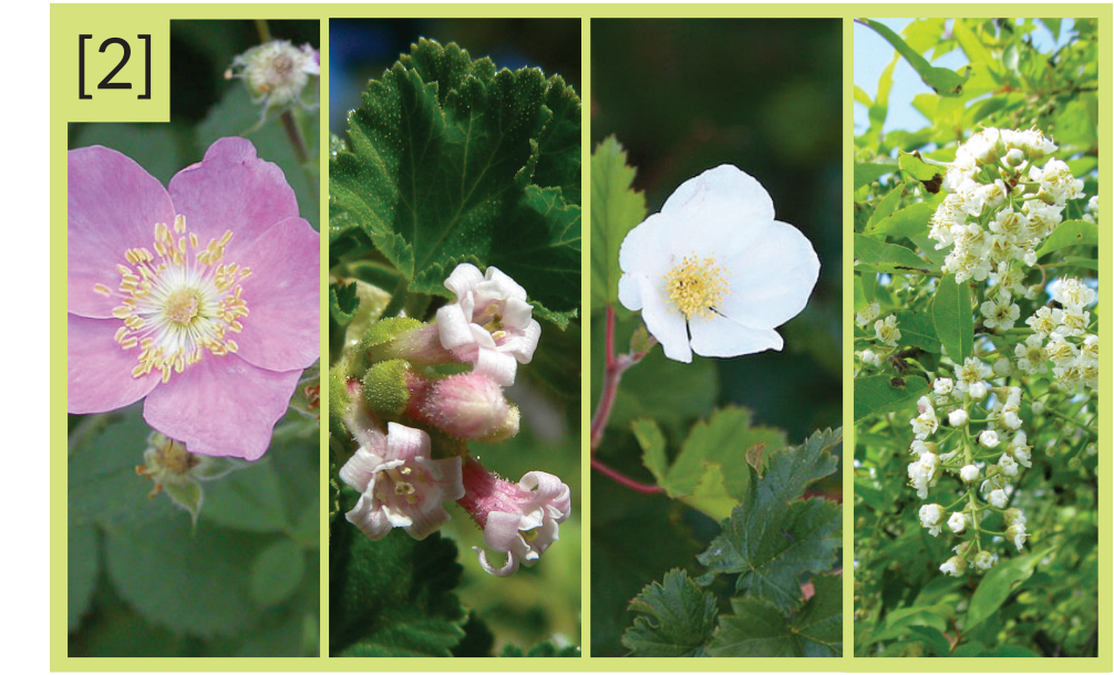
Native Flowering Shrubs- Wild Rose, Wax Current, Boulder Raspberry, Chokecherry, etc.