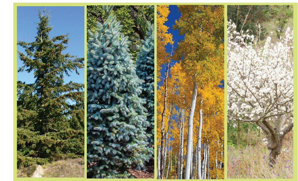
Trees- Douglass Fir, Baby Blue Spruce, Prairie Gold Aspen, American Plum