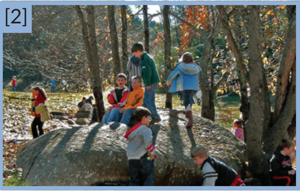
Natural Play- Rocks and logs will stimulate children and pique their interest in the natural beauty Estes Park has to offer.